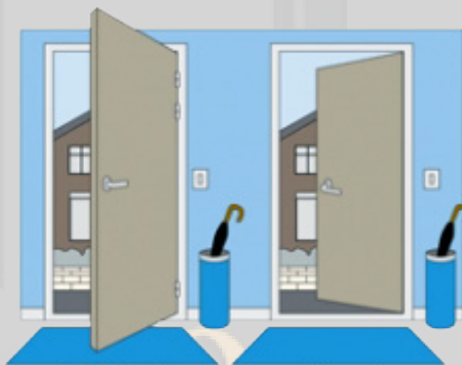
RIGHT HAND INWARDS OPENING LEFT HAND OUTWARDS OPENING